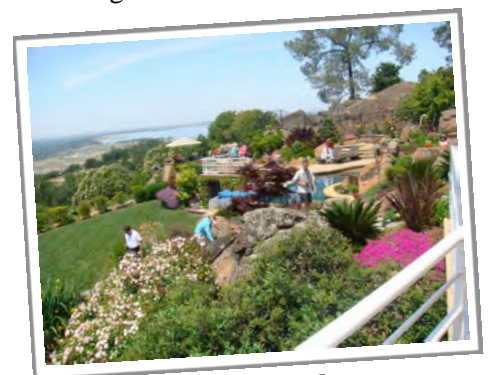
EDH Garden Tour

success. More than 500 guests attended and more than 80 volunteers assisted both prior to the event and throughout the day. Guests visited seven lovely gardens in EDH. The event raised